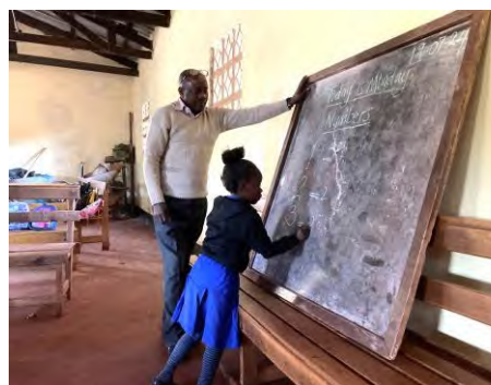
Temporary facilities inside the Church